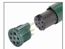
Replaceable plug insert

Part No. 30-215429 - 12' QWIK-CHANGE™ PAK (Power Air Kit)